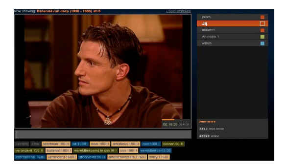
Figure 9. Waisda? Tagging interface

In 2009, a consortium including the Netherlands Institute for Sound and Vision, KRO broadcasting, and VU University Amsterdam launched the video labeling game called Waisda? (Figure 9). It uses gaming as method to annotate television heritage. Similar to the 'Games With A Purpose' serious gaming concepts developed by Von Ahn, players receive points if their tag matches a tag that their opponent has also typed in within a given time-frame [1]. The game-play of Waisda? focuses on reaction and precision. From the point of the archive, the underlying assumption is that tags are probably valid if there is mutual agreement between players.