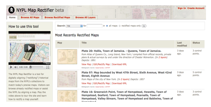
Figure 4. Aligning historical maps

A fourth example of this type of crowdsourcing is New York Public Library's Map Rectifier Project (Figure 4). This is an online environment in which the public aligns ("rectifies") historical maps from the NYPL's collections to match today's precise maps [19].