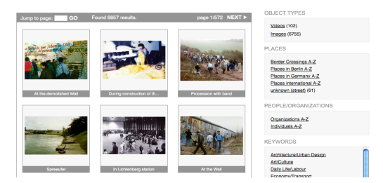
Figure 7. Wir Waren So Frei

In the UK, the RunCoCo<sup>12</sup> initiative delivers training and support to groups wishing to run community collections. The project is developing training materials, and organizing and running workshops to support projects wishing to follow the community collection model. The project is a direct continuation of the work done for the University of Oxford's Great War Archive, which created an online resource of 6,500 items contributed by the general public<sup>13</sup>. This project is also developing the open-source CoCoCo (community contributed content) software to make it available for any other project to collect user-generated content via the Web.