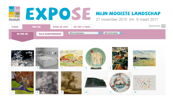
Figure 10. Expose: my favorite landscape

between the crowd's judgment and the judgment of the experts.