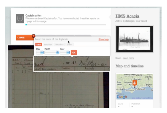
Figure 3. Old Weather: transcribing ship logs

by the Citizen Science Alliance community, which has enrolled 349,000 volunteers in to process images of stars, galaxies and other astronomical formations [32].