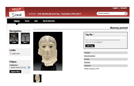
Figure 8. steve.museum tagging interface

Dozens of GLAMs have embarked on similar projects to steve.museum [46]. For instance, the Powerhouse Museum in Sydney launched their social tagging project in 2006. When a user submits a tag, it is incorporated in the online catalogue. Tags can also be corrected and removed by other users if they are deemed incorrect. Within six months, almost 4,000 tags were added to over 2,200 objects in the online catalogue. Over 500 of these tags "were deleted, edited for spelling, or removed by other users and the system administrator" [12].