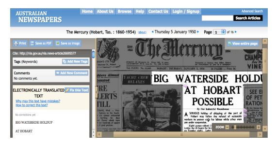
Figure 2. Australian Newspapers

A typical example of crowdsourcing corrections is the Australian Newspaper initiative from the National Library of Australia. The Library is overseeing the mass digitisation of 830,000 newspaper pages dating from 1803. The newspaper pages are converted into electronically translated, searchable text through the use of Optical Character Recognition (OCR). Using this technology for historical newspapers delivers poor and inaccurate results. The library launched the first service in the world that allows users to correct the OCR'ed text (Figure 2). Without too much active promotion, a subsequent call for user participation in 2008 was greeted with great enthusiasm by end-users. The administrators note that by "October 2009 over 6000 members of the public had already enhanced the data significantly by correcting over 7 million lines of text in 320,000 articles, and adding 200,000 tags and 4,600 comments to articles. One exceptional user has corrected over 285,000 lines of text in over 7,000 articles." [20].