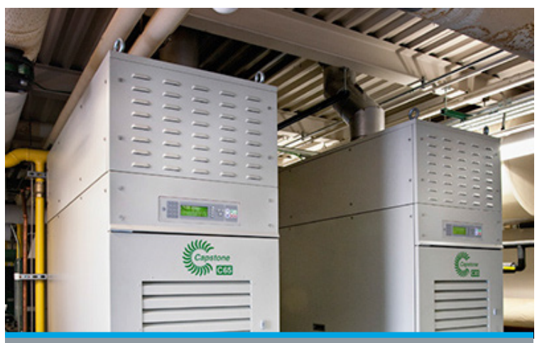
Microturbine CHP installation at a commercial facility.