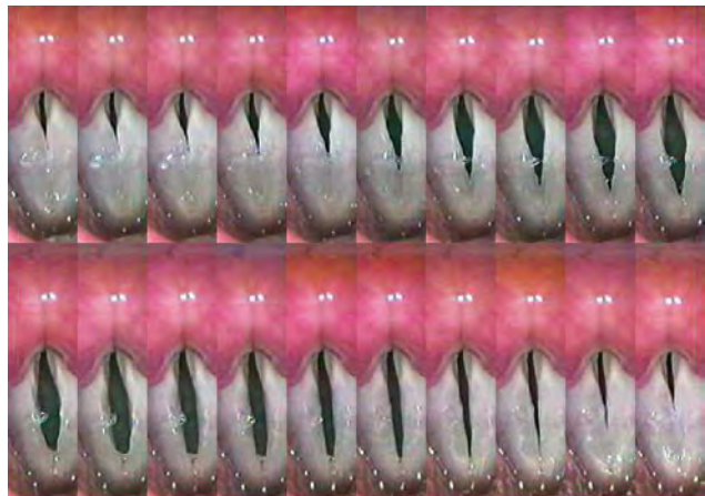
Fig. 3.1 “Representative” set of images from stroboscopy depicting “one” vibratory cycle

The duration of vocal fold closure is also an important clinical assessment parameter. At modal pitch and intensity, vocal fold vibratory closure should occur approximately half of the vibratory cycle. This can be measured in a detailed fashion us-