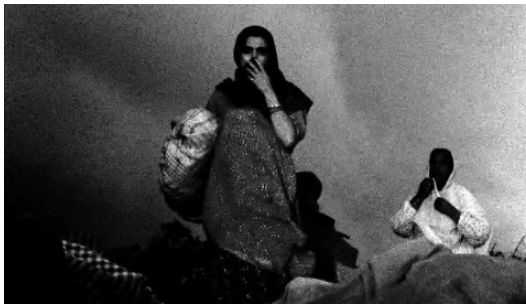
Figure 3.6 Death in life: the debris of the Partition in Tamas.

contemporary Bombay with its explosive communal situation. Both films look at the dead end facing the community, and so if the Bhiwandi riot of 1984 marks the everyday in Salim Langde Pe Mat Ro , in Naseem it is the build-up to the demolition of the Babri Masjid in 1992 in the months preceding 6 December that imbues the life of an ordinary Muslim family with extreme tension, insecurity and finally reactive anger on the eve of the riots that follow the demolition. The gentler past of friendship and understanding between communities that Naseem's grandfather evoked through his qissas (stories) spoke of a world that had definitely ceased to exist. Shyam Benegal's Mammo (1994) also looks at the fallout of this history and the difficulties faced by Muslims who have families scattered across the two nations. The eponymous character, Mammo, radically redefines the meaning of home, rejecting national identities thrust upon individuals by history and politics, as she refuses to accept that the afterlife of Partition in the policies of the two nation states will dictate to her what her choice of home ought to be.