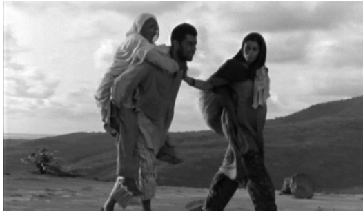
Figure 3.5 The epic journey into exile: Tamas .