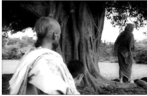
Figure 3.3 The outcast Yamuna in Ghattashraddha .