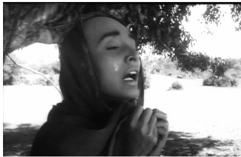
Figure 3.4 Yamuna abandoned by all, Ghattashraddha .

the other hand, confronts directly the consequences of Muslim identity in post-partition India. In the early 1970s, that Garm Hawa goes back to the immediate aftermath of Partition and represents the painful experiences of a Muslim family in Agra under intense pressure to leave for Pakistan is clearly indicative of an attempt to give voice to a repressed history in public discourse, and draw attention to the forces of communalism that had not ended with Partition.