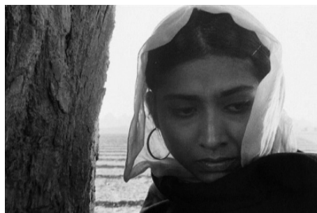
Figure 3.2 Time stands still, Balo waiting in Uski Roti .