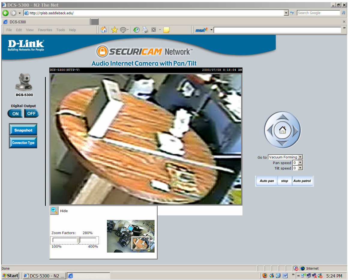
Figure 1: Rapid Prototyping Laboratory located at SC

Project Web site (see Figure 2) was also developed so that users can access the site and see the calendar of the events going on in the TTU and Saddleback College laboratories. The website also has various features related to project workshops, instructional RP materials, project team, project polls and other things.