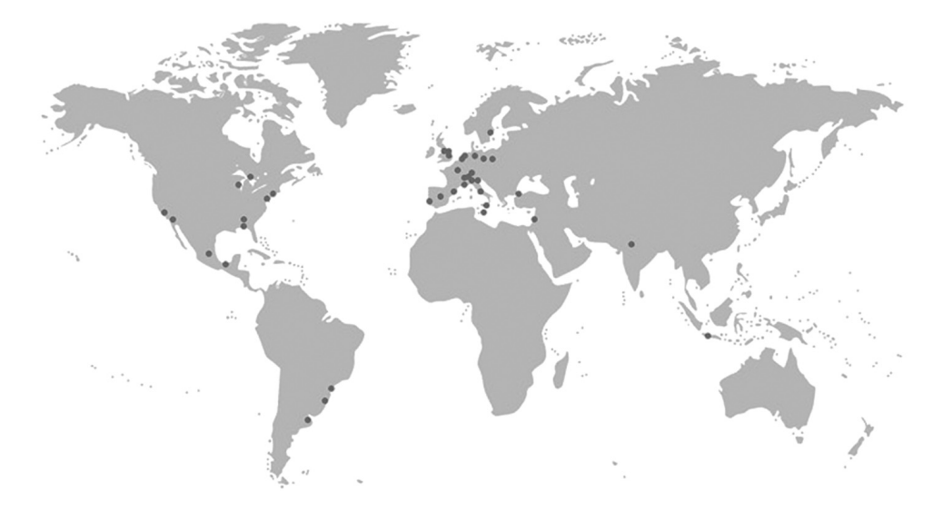
Figure 1.1 Cities analysed in this Handbook.

such as border cities, harbour cities and cities that find themselves at the cross-roads of two different nations or cultures.