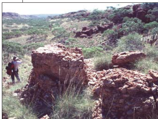
Australian Davenport Range showing Cambrian conglomerate exposure (foreground) and the flat ridge of the "Ashburton Surface" (background).

Some of the oldest rocks on Earth are found in the Davenport Range of central Australia, having crystallized in the Pre-Cambrian (>560 million years ago) or the Cambrian (about 560 to 530 million years ago). Cratons are the first continental land masses to form, and the remnants of the first landmasses make up the stable and thick crustal cores of sev-