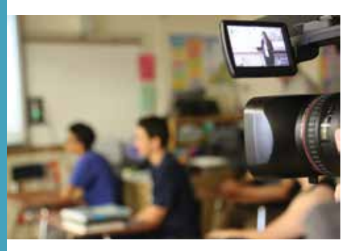
This media-based resource for U.S. teachers of Arabic language and Arab culture illustrates effective strategies for helping students develop communication skills in Arabic by using the 5Cs from the ACTFL World Readiness Standards for Learning Languages. 2016 WGBH Boston with Qatar Foundation International and ACTFL.