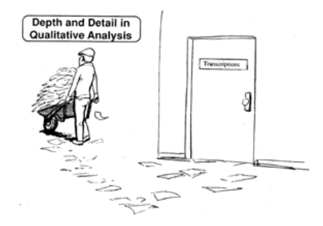
© 2002 Michael Quinn Patton and Michael Cochran Reproduced with kind permission of Michael Quinn Patton

You will need to be as rigorous as possible to get the most out of the collected information, and for your results to be credible both inside and outside MSF. There are a number of 'good practice' guidelines to bear in mind throughout the analysis process<sup>9</sup> (see table overleaf).