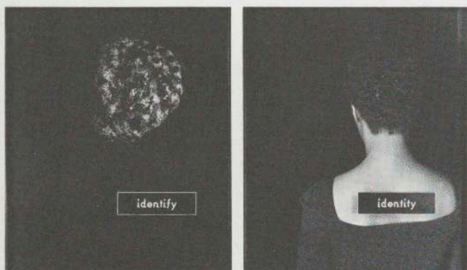
ID. 1990. Two black-and-white silver prints, two plastic plaques; diptych, overall 49" x 7" (122 x 210 cm). Edition of four.