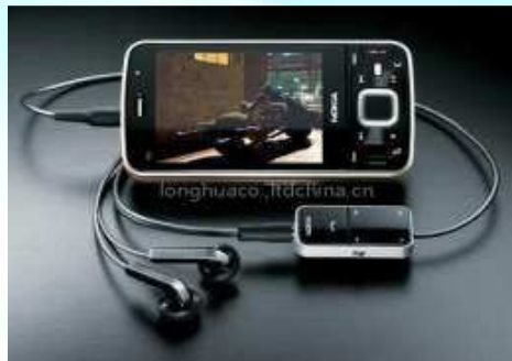
FIG.3: 3G MOBILE PHONE

International Mobile Telecommunications-2000 (IMT--2000), better known as 3G, is a generation of standards for mobile phones and mobile telecommunications services fulfilling specifications by the International Telecommunication Union. The use of 3G technology is also able to transmit packet switch data efficiently at better and increased bandwidth. Transmission speeds from 125kbps to 2Mbps. In 2005, 3G is ready to live up to its performance in computer networking (WCDMA, WLAN and Bluetooth) and mobile devices area (cell phone and GPS).Voice calls are interpreted using circuit switching. Access to Global Roaming and Clarity in voice calls. Fast Communication, Internet, Mobile T.V, Video Conferencing, Video Calls, Multi Media Messaging Service (MMS), 3D gaming, Multi-Gaming etc. are also available with 3G phones.