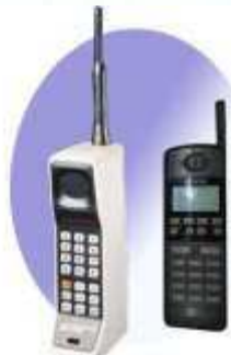
FIG.1: 1G MOBILE PHONE

1G technology replaced 0G technology, which featured mobile radio telephones and such technologies as Mobile Telephone System (MTS), Advanced Mobile Telephone System (AMTS), Improved Mobile Telephone Service (IMTS), and Push to Talk (PTT).