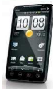
FIG.4: 4G MOBILE PHONE

Some of the applications are as per following: