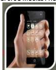
FIG. 6: 5G MOBILE PHONE