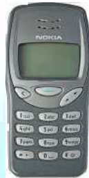
FIG.2: 2G MOBILE PHONE

GSM has its origin from the Group special Mobile, in Europe. GSM is also stands for Global system for mobile communication. Now GSM is used in more than 212 countries in the world. GSM technology was the first one to help establish international roaming. In comparison to 1G's analog signals, 2G's digital signals are very reliant on location and proximity.