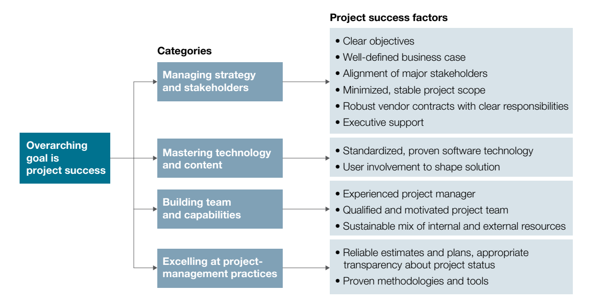
Exhibit 3 A 'value assurance' assessment indicates how a project is doing against 4 groups of success factors.

well-defined business case was the limited availability of funding during the prestudy phase. The study also revealed that the organization's inability to arrive at a stable and accurate project scope resulted from the infrequent communication between project managers and stakeholders about issues such as new requirements and change requests, which led to deviations from the original scope.