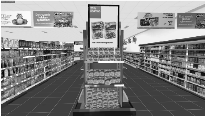
Figure 1a Location-incongruent shelf with the meal-mix ad