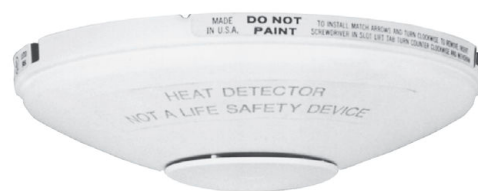
Fig. 2 Heat detector

Heat detectors are similar to the smoke detector, but it detects the heat of environment. Generally two types of heat detectors one is for rise of rate, it will react when the normal temperature of the atmosphere is increased and another one is fixed it will react when the temperature of the atmosphere will reach the particular temperature. It do the same function of the smoke sensor.