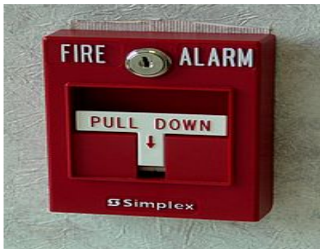
Fig. 2 Pull Alarm System

The manual pull station is an active fire protection device, which is manually pushed by the users by pushing the handle downside and the circuit will lock and activates the alarm systems.