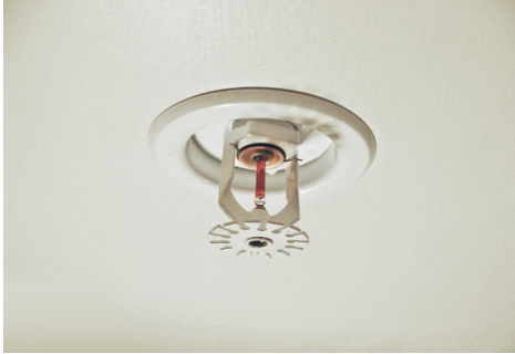
Fig. 2 Water sprinkler

will not shower the water until the fire heats the sprinkler; there is seal behind the mouth of sprinkler when the seal melts the nozzle will open.