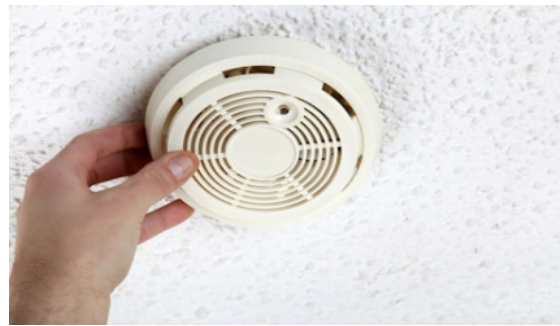
Fig. 1 Smoke detector

The smoke detector is an electronic device which detects presence smoke in a given area. Generally two types of smoke detectors are available in the market one is photoelectric detector and another one is ionization detector. The photoelectric detector emits small beam of light if the smoke affects the light beam it will sound alarm. The ionizing smoke sensor will response for the smaller smoke particles than photoelectric detector. Ionize detector gives a faster response for the flame smoke. The smoke detectors must required for certain areas elevators, electrical room and HVAC systems. Smoke detector will cause the elevator to recall the ground floor and activate the alarm system.