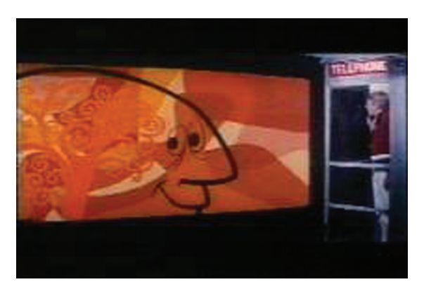
In 1967, The President's Analyst predicted that phones would become small enough to inject directly into the brain. By 2034, cell phones will certainly be small enough to hide in the ear canal.

In 2034: In an increasingly atomized and digitized world, people still have a core desire for human engagement and authenticity. Museums will be oases of the real in an increasingly virtual world. Along with the outdoors and places of worship, museums represent the best opportunities for getting away from it all.