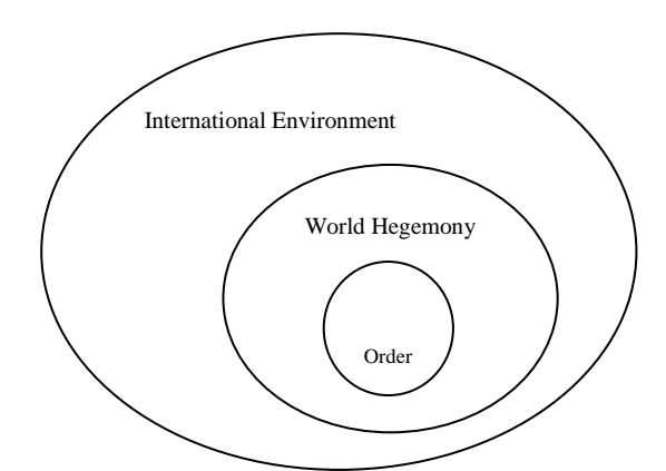
Fig.2- Order Based on Cooperation in the Persian Gulf

Therefore, three main conditions are needed so that the cooperation-based order is achieved and sustained: