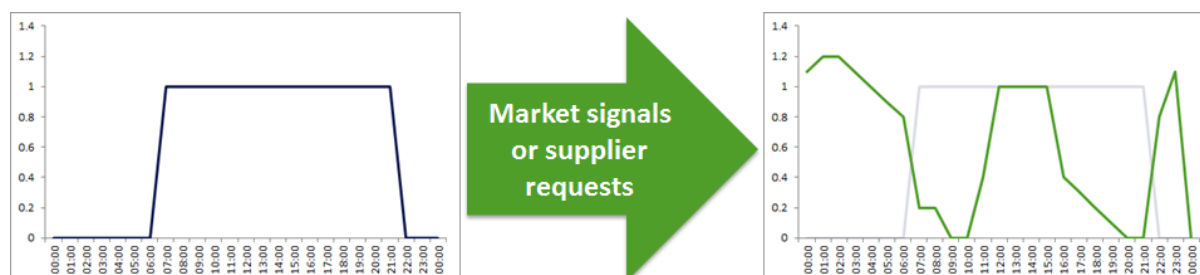
Scheme A. Shifting consumption to low-cost periods

consumption to time periods when electricity is available from the on-site VRE, as the flexible user will be able to maximise the share of the overall demand covered by own production. This would lead to reduced energy costs, depending on the relation between the tariffs at any given moment and the on-site generation costs. Here, there can be also the option of feeding electricity back into the grid and being rewarded based on the agreement with the supplier, for example a “net-metering” scheme.