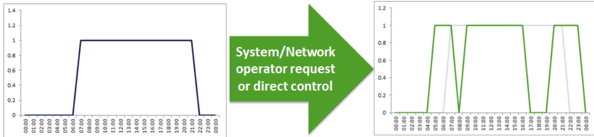
Figure B: Offering services to the power system

B.2 The use of FID in containing the frequency variations can also happen through the signals sent by the Balancing Responsible Party (BRP), either directly to the industrial user or through an aggregator. These signals aim to activate the flexibility of the industrial user in order to support the balancing of the BRP portfolio.