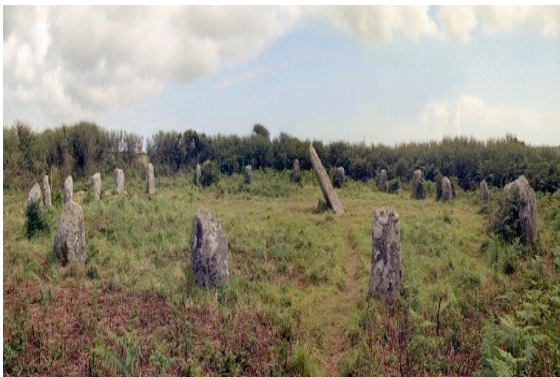
Boscawen-un Circle, Cornwall, UK

The outer bank, still very impressive, was originally 17m (55ft) high from ditch bottom to bank top. The stones, each weighing about 40 tons or more,