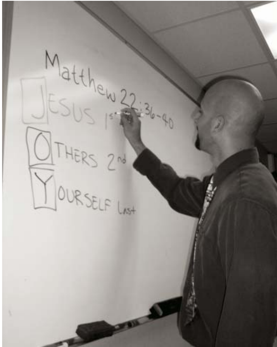
The author facilitates a discussion of the JOY principle.

shift in my thinking, as well as in my students' thinking. They have begun to view life from outside the box. Choice Theory provides them with tools to use in considering other people's perspectives, as well as to make personal improvements. An activity that promotes this kind of thinking is called a "plus delta" (+ D). When students leave my classroom at the end of the day, they share either a + D, a positive change they have made, or a "keeper" for the day, an academic nugget worth coming to school to learn.