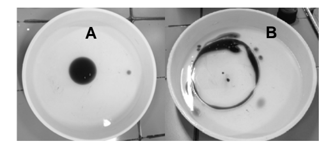
Figure 3: Illustration of motor oil drop before (A) and after (B) dispersion due to the action of biosurfactant produced by C. bombicola grown in distilled water supplemented with 5% corn steep liquor, 5% molasses and 5% soybean waste frying as substrates.

The biosurfactant produced by C. bombicola showed high dispersant activity for the lubricating oil of car engine, which could facilitate the targeting of oily spots in the ocean. The cell-free broth (crude biosurfactant) achieved a dispersion rate of 80 % of the initial diameter of the oil, whereas the dispersion rate obtained with the isolated biosurfactant was 50 %. The results were observed when low amounts of biosurfactant were used, thus demonstrating the potential of these compounds in transporting and solubilizing oil spots on marine aquatic environment (Figure 3).