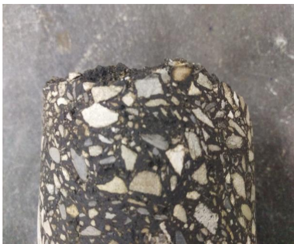
Figure 4 The bottom surface of a typical drilled sample

We can identify from Table IX and Table X, respectively, the results of measured thicknesses and calculated unit weights, using 2-, 4- and 6-points measurement for Natural material with 1/2", 3/4" dense grades and BOF slag with 1/2", 3/4" dense grades of drilled Specimen considering the specimen non-cutting and cutting to be flat surfaces.