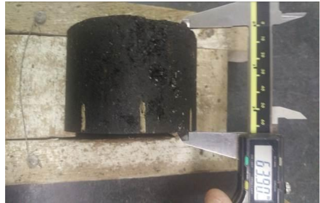
Figure 2 Direct measurement on thickness of a Marshall sample