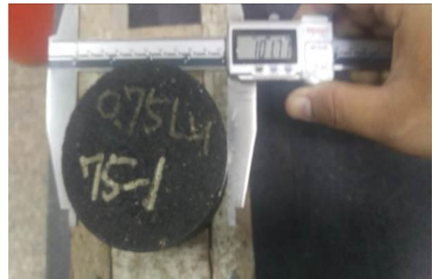
Figure 3 Direct measurement on diameter of a Marshall sample