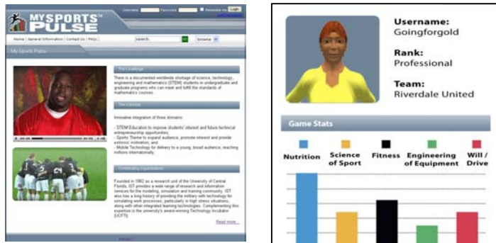
Figure 3- My Sports Pulse Project

text messages or email, and can also be accessed and answered directly through the My Sports Pulse website. As students answer questions, they earn points in various knowledge areas and build up their own avatar to compete with other students and schools. The My Sports Pulse program has been piloted with several schools inside and outside of the US, with promising results.