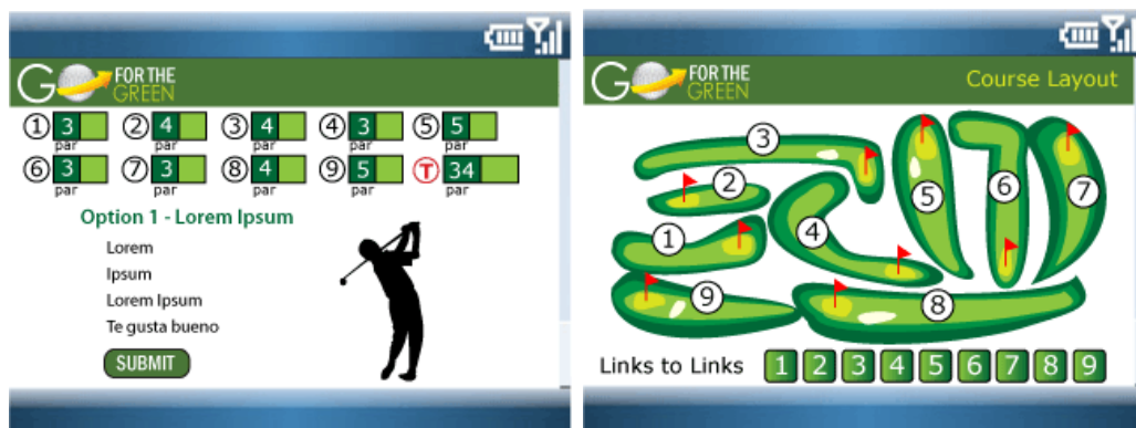
Figure 4- Go for the Green

Go for the Green is a mobile web game, developed for The Willis Organization , that uses a golf theme to reinforce key sales concepts. Nine holes of the golf course are mapped to nine steps in the sales process, with each hole presenting several questions and feedback items related to that particular step. Users attempt to complete the full course by answering all questions and avoiding common "traps" in the sales process. By using streamlined mobile web development rather than creating a specific game application, we are able to deliver this content to a wide range of user devices including iPhone, Blackberry and various Symbian and Windows Mobile platforms.