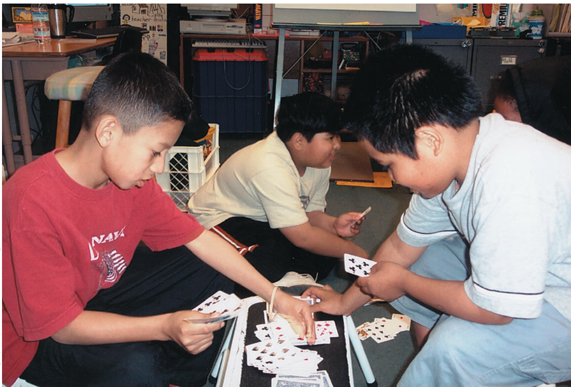
Children run through a practice game before entering into competition.