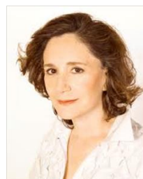
Sherry Turkle Abby Rockefeller Mauzé Professor of the Social Studies of Science and Technology in the Program of Science, Technology, and Society at MIT