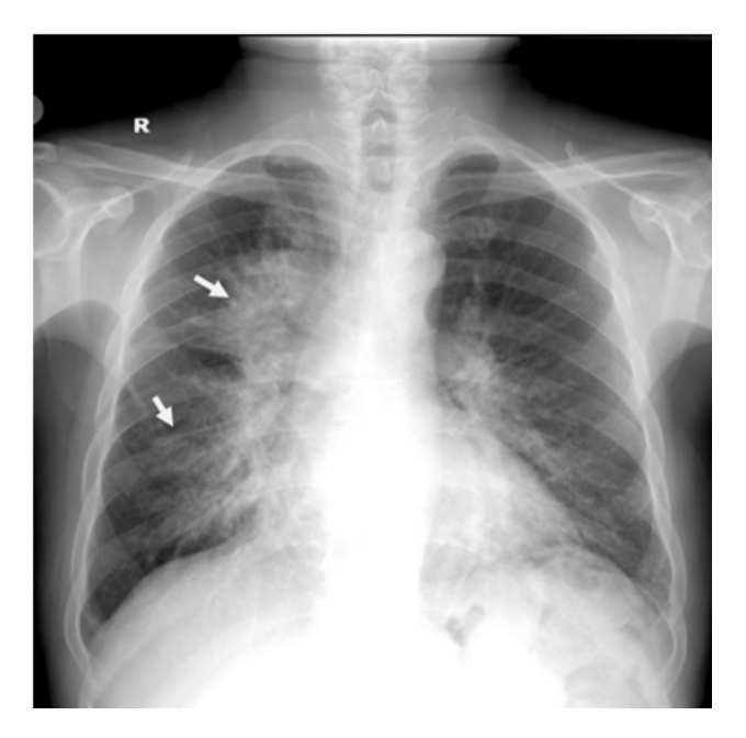
Figure 1. Postero-anterior chest X-ray of patient showing right hilar opacity with cavitary lesions on the right lower zone of lung.

(fractionated cyclophosphamide, vincristine, doxorubicin, and dexamethasone) chemotherapy. In the control thorax CT, cavitary lesions got smaller (Figure 3). The patient was transferred to the bone marrow transplant unit for stem cell transplantation.