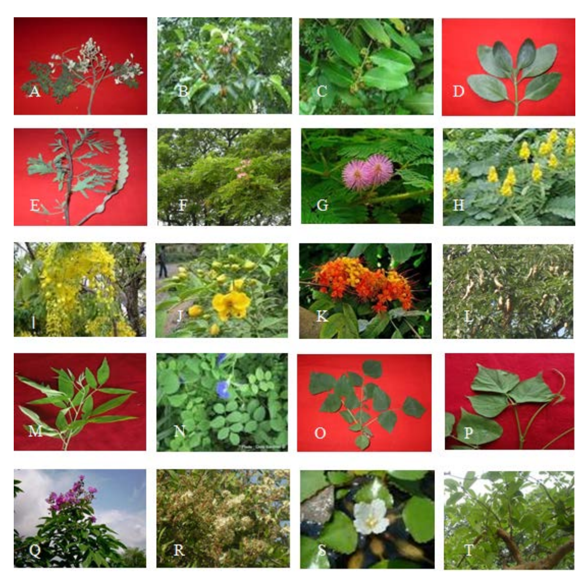
Figure 2. Photographs of important angiosperm plant species in the study area

A)Moringa oleifera Lam., B) Mimusops elengi L., C) Diospyros malabarica (Desr.)Kostel, D) Bryophyllum pinnatum (Lam.) Oken, E) Acacia nilotica (L.) Del., F) Albizia procera (Roxb.) Benth., G) Mimosa pudica L., H) Senna alata(L.) Roxb., I) Cassia fistula L., J) Senna sophera (L.) Roxb., K) Saraca indica L., L) Tamarindus indica L., M) Cajanus cajan (L.) Huth., N) Clitoria ternatea L., O) Erythrina variegata L., P) Lablab purpureus (L.) Sweet., Q) Lagerstroemia speciosa (Linn.) Pres., R) Lawsonia inermis Linn., S) Trapa bispinosa Roxb., T) Psidium guajava L.