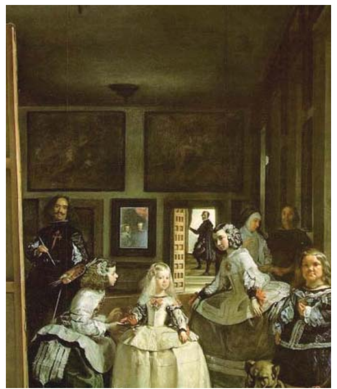
(reproduced with permission)