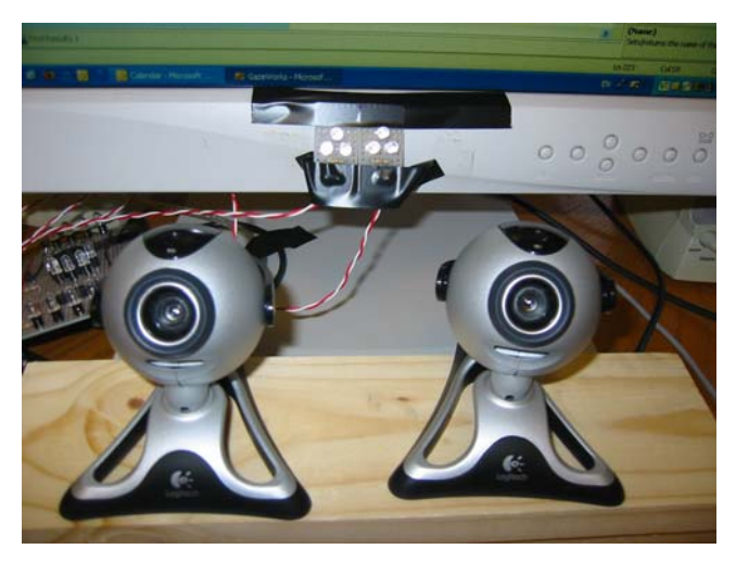
Figure 1: The low-cost prototype in development uses commercial-over-the-shelf cameras modified to work in the infrared spectrum. The glint source pictured above uses IR LEDs (invisible to the human eye).