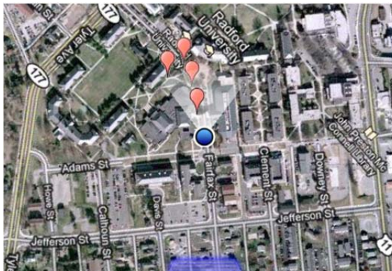
Figure 3. Overhead view