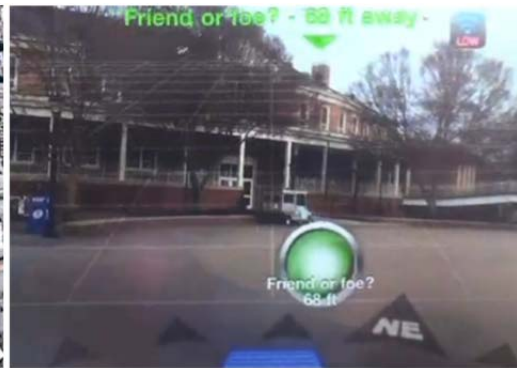
Figure 4. Live view