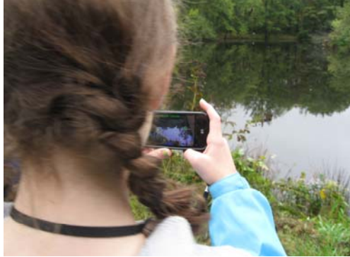
Figure 1. Students collecting data