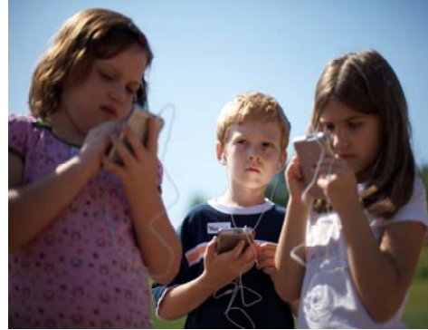
Figure 2. Students analyzing data

The potential power of AR as a learning tool is its ability “to enable students to see the world around them in new ways and engage with realistic issues in a context with which the students are already connected” (Klopfer & Sheldon, 2010, p. 86). These two forms of AR (i.e., location-aware and vision-based) leverage several smartphone capabilities (i.e., GPS, camera, object recognition and tracking) to create “immersive” learning experiences within the physical environment, providing educators with a novel and potentially transformative tool for teaching and learning (Azuma, Baillot, Behringer, Feiner, Julier, & MacIntyre, 2001; Dede, 2009; Johnson, Smith, Willis, Levine, & Haywood, 2011). Immersion is the subjective impression that one is participating in a comprehensive, realistic experience (Dede, 2009). Interactive media now enable various degrees of digital immersion. The more a virtual immersive experience is based on design strategies that combine actional, symbolic, and sensory factors, the greater the participant’s suspension of disbelief that she or he is “inside” a digitally enhanced setting. Studies have shown that immersion in a digital environment can enhance education in at least three ways: by allowing multiple perspectives, situated learning, and transfer.