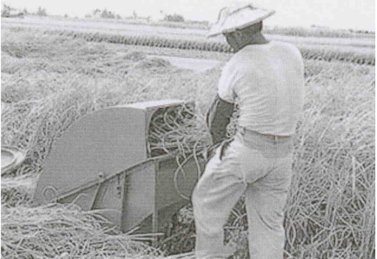
Figure 3. Rice Threshing by Tractor