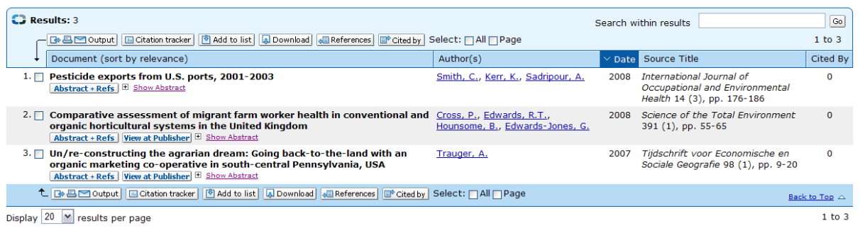
Figure 2 is search results of the Figure 1. It shows that the above OA research report which was deposited online by FAO in the year 2005 could attract three citations from other journals indexed by the Scopus. Note that we manually checked the cited references through selecting "Abstract +Refs" below each retrieved results to remove possible false matches.