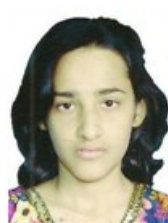
Jain Manali (1108/1500)