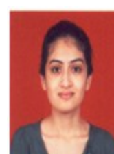
Shah Nikita (1112/1500)