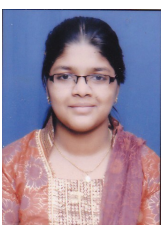
Nadar Rachana (1134/1500)