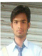
Karle Abhijit (1014/1500)