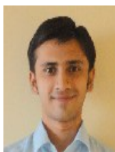
Bbadane Aniket (1049/1500)