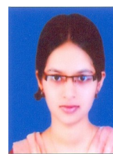
Shaikh Shahnaz (958/1500)