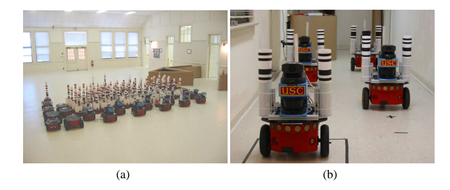
Fig. 1. (a) The heterogeneous robot team, with three classes of robots (mapper, leader and sensor); the sensor robots are based on the ActivMedia AmigoBot. (b) The mapping subteam: note each of the four robots carries a unique laser-visual fi ducial; these fi ducials can be detected and identified at ranges in excess of 8m, and the relative range and bearing of the robots can be determined to within a few centimeters and a few degrees, respectively.

slightly less-capable leader robots equipped with scanning laser range-finders and cameras; and a large number (approximately 70) of simple sensor robots equipped with a microphone and a crude camera. All of the robots are have 802.11b WiFi, and a modified ad-hoc routing package (AODV) is used to ensure network connectivity.