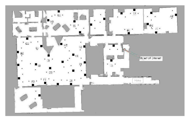
Fig. 6. Autonomously planned sensor net positions (black squares) and planned leader waypoints associated with each sensor position (small dots).