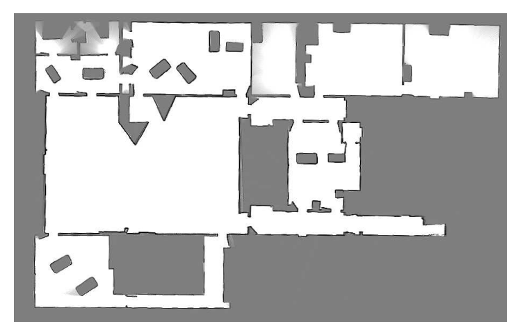
Fig. 4. Occupancy grid map produced during a multiple-robot, multiple-entry trial: two robots entered from the door at the right top, another two robots entered from the door at the right bottom (the relative pose of the two doorways was unknown). The environment is approximately 45 by 25 meters in size, with an internal area of 600 \text{ m}^2 .

not strictly necessary, was performed to achieve faster map completion). Maps were generated in real time, for an environment approximately 600 \text{ m}^2 in size. Map accuracy is comparable to or better than that achieved by a human survey team using a tape-measure, pencil and paper.