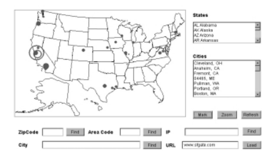
Figure 1: Geographical distribution of hyperlinks to www.sfgate.com.