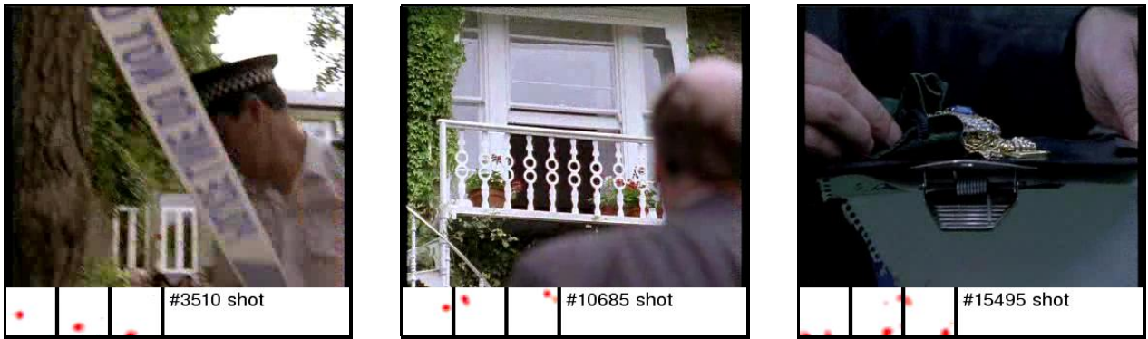
Figure 4: Frames and SOM signatures of three video shots.

The shots selected by the system are shown by the bottom row boxes in Figure 3. Visual examination of the created summary reveals that the system was able to include 12 of the listed 14 events. Events 7 and 14 were left missing, whereas six of the ground truth events were selected more than once. Five such clips were selected that did not depict any of the listed events. Due to the amount of duplicated clips in this and other development set summaries, we decided to reduce the summary durations from the maximum of 4% by introducing an additional similarity threshold (Section 3.4) if the included clips were overly similar.