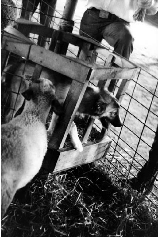
A Sharplaninac puppy investigates a hay feeder in the pen it shares with some lambs. It will grow up to be a flock guard dog.

instincts. Be sure they learn commands to drop (such as Down!) and to stay there (such as Stay!), and enforce those commands. Then teach separate commands to go gather the sheep from your right and from your left. Most dogs will crowd too closely at first, but will usually learn on their own to give the sheep more room. After some weeks, one can start to teach the dog to herd along with the herder. That is contrary to their instincts, so be patient. One expert trainer comments that the average person trying to train the dog doesn't know how to make the stock move—and therefore is not qualified to tell the dog what to do.