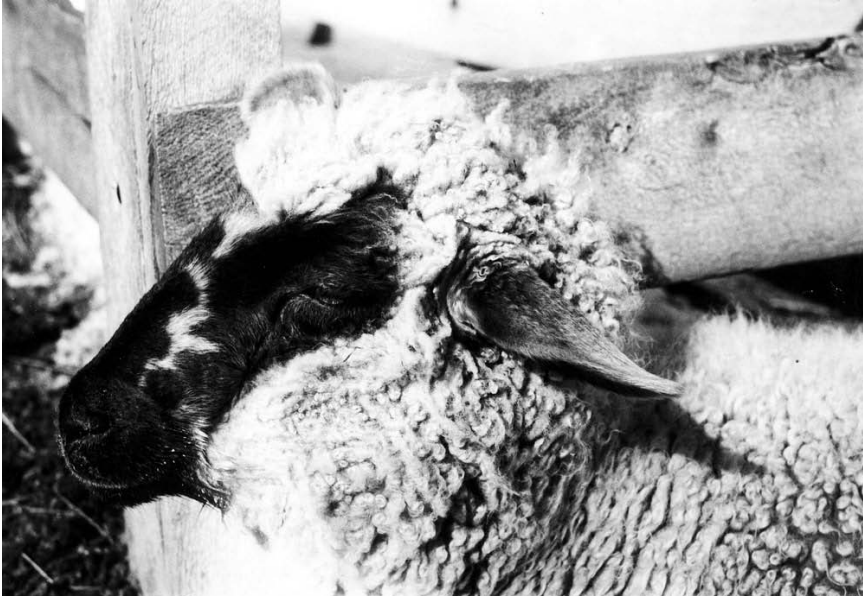
Eyes almost closed and drooping ears tell you this is a sick sheep. She recovered nicely after receiving some bloat medicine.

be simple to recognize, but you'd be amazed how well a blind one can get along by following the sound of the flock. Watch the ears too, for a sheep with drooping ears is probably a sick sheep that needs your help.