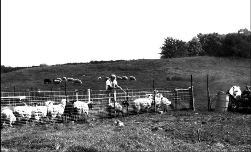
Treating wooled sheep for external parasites can be done in a temporary chute using a tractor-powered sprayer rig.

diluted mixture down the sheep's back, by applying a paste, or by placing a small amount of a concentrated material on the sheep's skin. Dosage to the sheep must be carefully regulated, and the shepherd must take precautions to avoid contact with them. They are readily absorbed through the skin, so rubber gloves should be worn and contaminated clothing washed immediately after use. Ectrin is a pour-on approved for sheep.