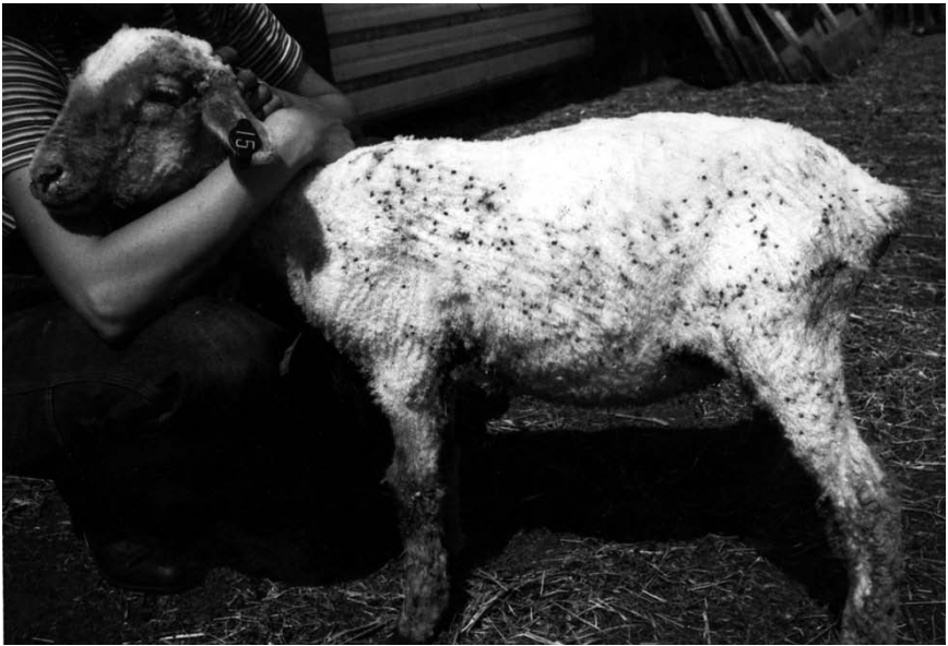
This yearling ewe weighed only eighty pounds—far less than her flock mates—because of this heavy infestation of sheep keds. (This ewe was not from my flock.)