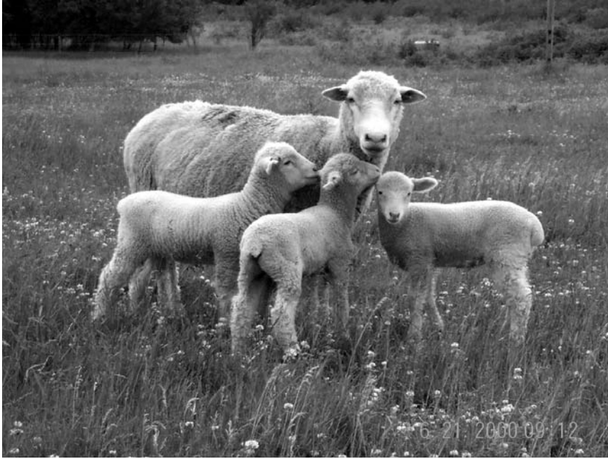
Here is a Tamarack Farm mostly Dorset ewe (who has one copy of the Booroola gene) with her triplets. Email tamarack@pinenet.com for information.

favorite breed for a number of generations, you will now have a sheep that exhibits the traits of your favorite breed, but now produces nearly one more lamb than it did before.”