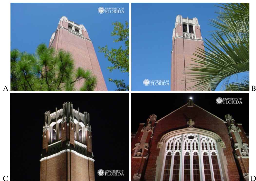
Figure 3-2. Series of University of Florida landmarks. A) Taken from the base of Century Tower looking upward at 3:00 PM, B) taken from the northwest corner of the Music Building, C) taken from the CSE atrium at 9:00 PM and D) the University Auditorium. A, B, & D are labeled correctly but C is ambiguous. (Note: the caption in the list of figures does not include the sub-part