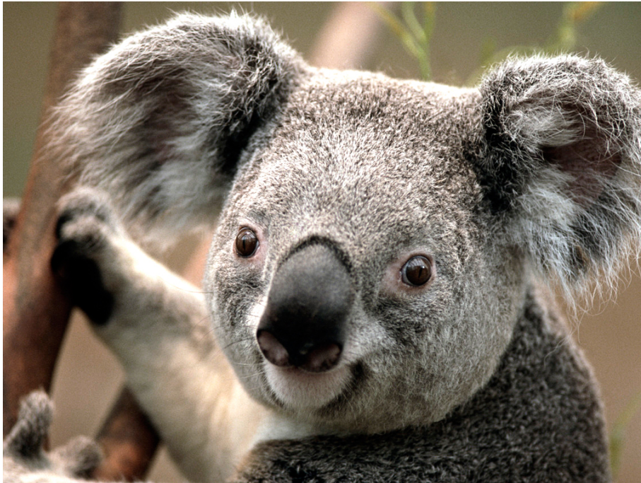
Figure 1-1. Cute koala.