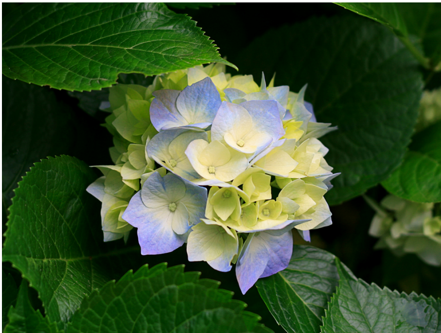
Figure 1-2. Another beautiful hydrangea,