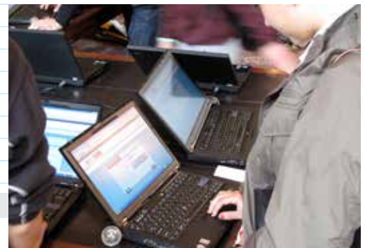
A student signs up online using the TurboVote website.