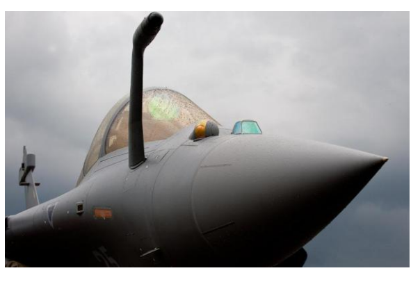
Figure 12. The OSF (Optronique Secteur Frontal) system of the Dassault Rafale.

PIRATE (Passive Infra Red Airborne Tracking Equipment) of the Eurofighter Typhoon (EUROFIRST consortium): A 2^{nd} gen. system (Imaging IR), combines FLIR and IRST, allowing the tracking of up to 200 targets, to distances up to 50 – 100 km ([98]).