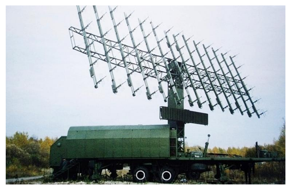
Figure 9. The 3D VHF AESA Radar 1L119 NEBO SVU, developed by NNIIRT (Russia) and offered for export by Rosoboronexport (the sole state export entity for defence products in Russia). It is a mobile, long range surveillance radar, featuring modern technology, able to detect stealth aircraft from considerable distances ([80]).