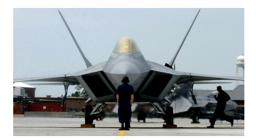
Figure 2. An F-22A Raptor, ready to go. A single-seat, twin-engine, supermaneuverable, 5<sup>th</sup> gen., air superiority stealth fighter. Taking into account its all-aspect stealth, speed, agility, situational awareness and combat capabilities, it is considered as one of the most capable jet fighters today. The U.S. have decided not to export it.