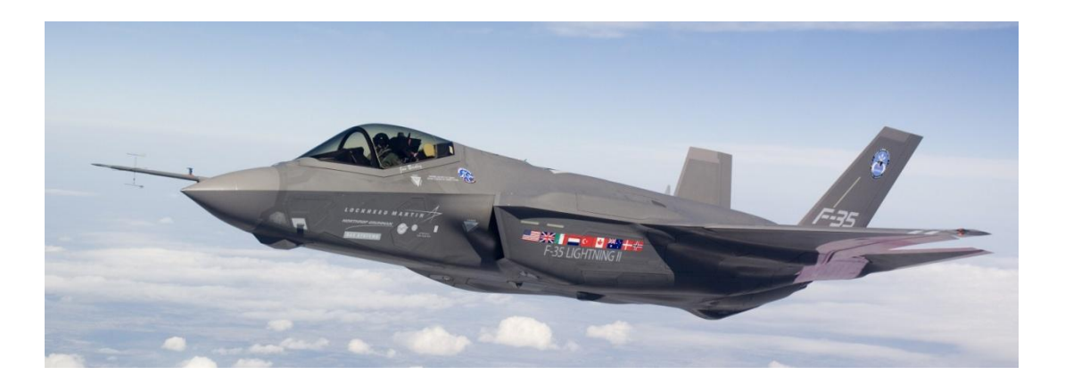
Figure 3. The F-35A Lightning II during development phase. A single-engine, 5<sup>th</sup> gen. multirole fighter with stealth capabilities, set out to repeat the success of the F-16 ([4]).