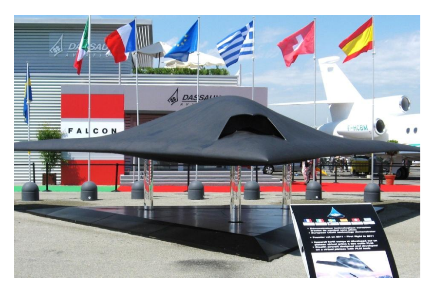
Figure 5. The Dassault nEUROn stealth Unmanned Combat Air Vehicle (UCAV). It is a "technology demonstrator" developed by Dassault (France), Alenia Aermacchi (Italy), SAAB (Sweden), EADS-CASA (Spain), Hellenic Aerospace Industry (Greece) and RUAG (Switzerland)<sup>4</sup>.

Sharp dihedral corners and parallel surfaces contribute also to the RCS. Therefore, the twin vertical fin empennage, as in the classic F-15E (not the F-15SE), is prohibited. Stealth aircraft have either canted tail fins or no tail fin at all (as in the B-2 Spirit). Regarding existing stealth aircraft, it is also evident that the leading edges of the wings and of the horizontal tail fins (stabilizers) are parallel. This applies to the trailing edges, as well. The aim is always the same: reflect the radar energy to certain, irrelevant directions, and thus keeping the (monostatic) RCS low.