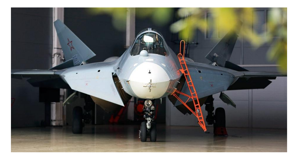
Figure 4. A Sukhoi T-50 during the recent MAKS 2013 air-show. The T-50 is the prototype for the PAK FA, a 5<sup>th</sup> gen. stealth multirole fighter, expected to equip the Russian Air Force and Navy in 2016. It will also be the basis for the FGFA for India.

For example, if a typical air-defence radar could detect a target with an RCS of 1 m<sup>2</sup> (small fighter) at 200 nautical miles (NM), it would detect a target of 5 m<sup>2</sup> RCS (large fighter) theoretically at 299 NM (however, the upper limit of most ground radars is set to 255 NM). A reduced RCS fighter of 0,1 m<sup>2</sup> RCS would be detected at 112 NM and a stealth fighter of 0,001 m<sup>2</sup> RCS would be detected at 36 NM. The same logic applies to any kind of radar. However, concerning fighter aircraft radars, as well as air-to-air missile seeker radars, the respective ranges are considerably shorter compared to the ones of a ground radar.