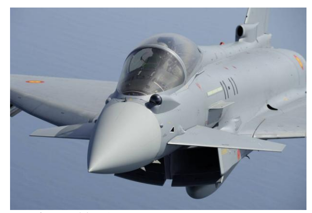
Figure 11. The PIRATE IRST system on a Spanish Air Force Eurofighter Typhoon.

AN/AAQ-40 Electro-optical Targeting System (EOTS) of the F-35 (L.M.): this is the second electro-optical system of the F-35, combining FLIR, IRST and laser. It provides detection, tracking and designation of ground targets, and also identification of aerial targets. It is based on the L.M. AN/AAQ-33 Sniper Advanced Targeting Pod [97].