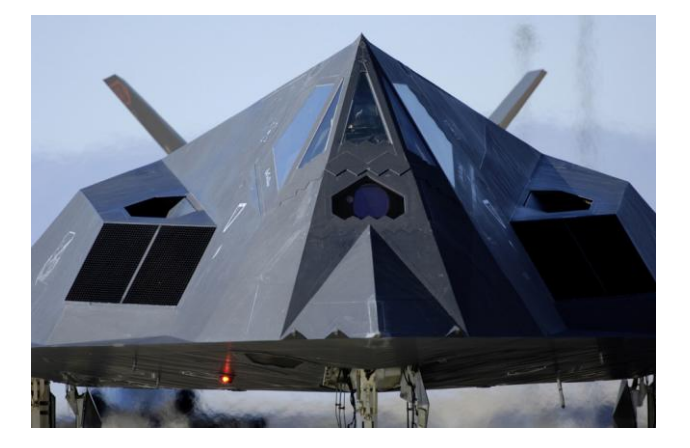
Figure 1. The Lockheed F-117A Nighthawk stealth ground attack aircraft. First flight in 1981, revealed to public in 1988, took part in all major conflicts and was retired in 2008. In the first Gulf war, it flew 1300 sorties, undetected and unharmed. It is true that if an F-117A was spotted during flight testing at Groom Lake (or Area 51 , as it is most commonly known), in the '80s, it would be hard to realize that it is just a new jet fighter...

In the meantime, during the '60s, the Russian physicist Petr Ufimtsev studied the scattering of electromagnetic waves and formulated what is known today as the Physical Theory of Diffraction [1]. His work was not considered by the U.S.S.R. as classified and was published. The main conclusion of his work (although it may have not been explicitly stated) was that radar return is related to the edge configuration of an object, not its size. U.S. engineers came across Ufimtsev's work and realized that he had set the foundations of finite analysis of radar reflections [2]. The advances in computer technology during the '70s allowed the performance of computer simulations using concepts of Ufimtsev's work, while also allowed the design of flyby-wire systems, which would be essential for the control of aircraft not optimized from the aerodynamic point of view. Following all these, after the 1975 static model project Hopeless Diamond , Lockheed constructed two aircraft demonstrators, under the code name Have Blue . Although both planes were lost during flight testing, the program was deemed successful, proving the concept of a stealth fighter aircraft.