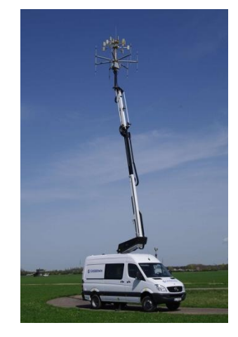
Figure 7. The Thales Homeland Alerter 100 ([68]). Figure 8. The Cassidian passive radar ([71]).

Homeland Alerter 100 (Thales, France): Introduced in 2005, the HA 100 utilizes FM radio and mobile telephony signals. It covers medium to low altitudes,