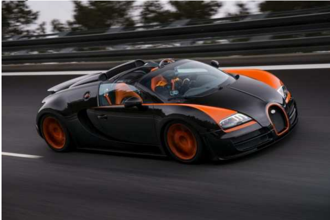
Fig. 2 Normal Image

The image obtained after applying Gaussian blur is as shown in fig. 3