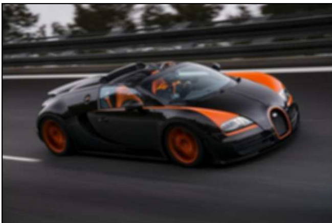
Fig. 3 Gaussian Blurred Image