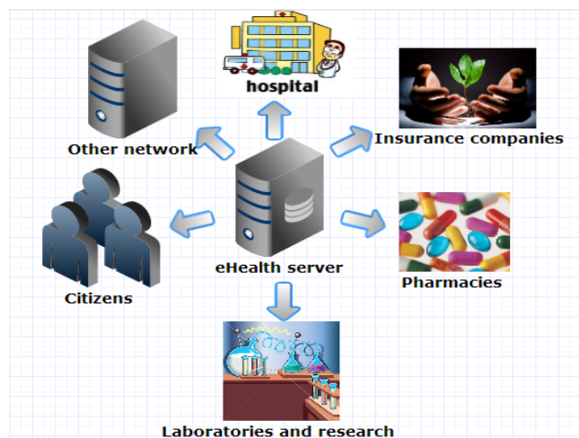
Figure1: Pictorial representation of ICT in Healthcare system