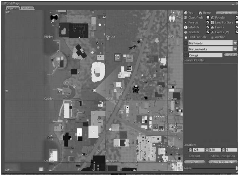
FIGURE 1.6. Looking at the world map, local area.

The three avatars you now approach are being controlled by people who, like you, are currently logged onto Second Life: they could be next door to your physical location, a hundred miles away, or on another continent; there