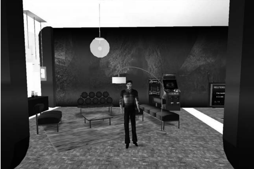
FIGURE 1.2. Standing at home.