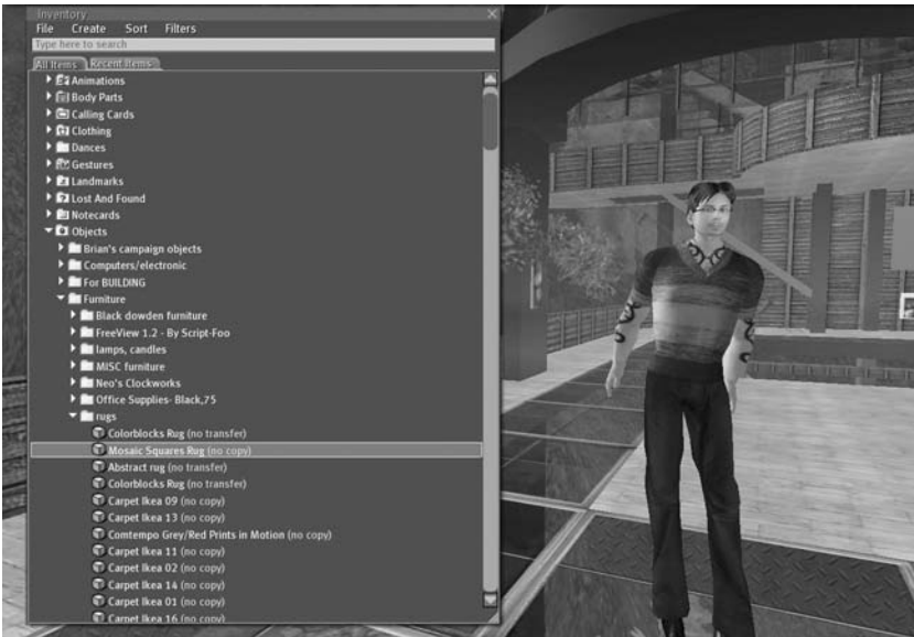
FIGURE 1.4. Perusing the “inventory” window.