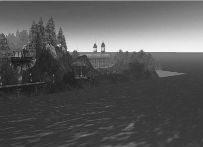
FIGURE 1.1. Arrival in Second Life.

Arrivals and departures—Everyday Second Life—Terms of discussion—The emergence of virtual worlds—The posthuman and the human—What this, a book, does.