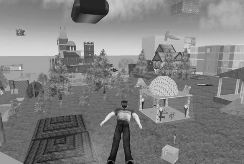
FIGURE 1.5. Flying across the landscape.

your inventory window and as if by magic, it materializes in your living room. You then right-click on the white rug; a “pie menu” appears with commands arranged in a circle. You choose “take” and the white rug disappears from your home; at the same time an icon named “white rug” appears in your inventory.