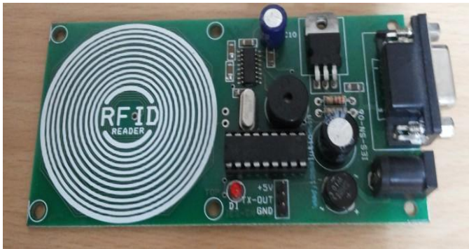
Fig. 4. RFID

RFID Reader Module transfigures radio waves reappeared from the RFID tag into a form that can be sent to Controllers, which can use it. RFID tags and readers have to be adapted to the same frequency in order to communicate. RFID systems make use of many different frequencies, but the most common and extensively used & supported Reader is 125 KHz. The reader has been lay out as a Plug & Play Module and can be plugged on a Standard 300 MIL-28 Pin IC socket form factor.