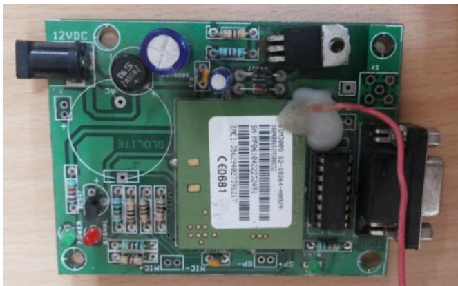
Fig. 2. GSM

GSM modem [sim300] affixed to the receiver section of Module. The microcontroller baud rate is set based on the baud rate of GSM modem. If at any pin any change in the state of particular signal leads to relay activation. This GSM model is used to communicate with manufacturer without any interference to check the product availability.